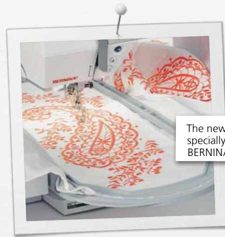
The new Maxi Hoop was specially developed for the BERNINA 7 Series.

A full 13-inch (330 including 10 inches right of the needle